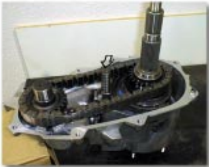
(Fig. 5A) New Main Output Shaft Assembly