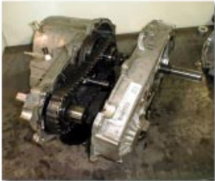
(Fig. 9) Rear Case Half Removal