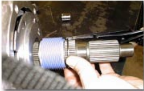
(Fig. 9A) Speed-o- Ring Gear Install