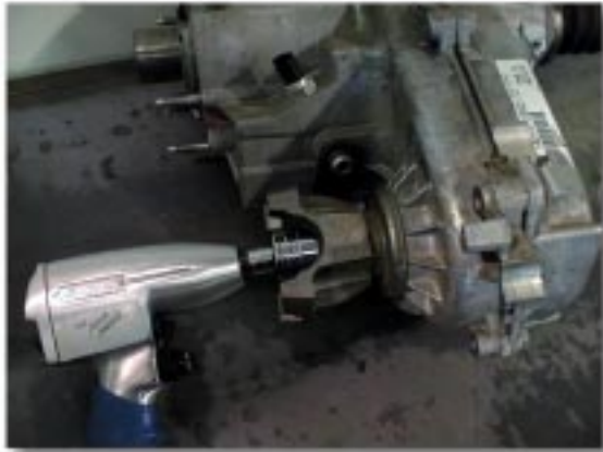
(Fig. 1) Yoke Nut Removal