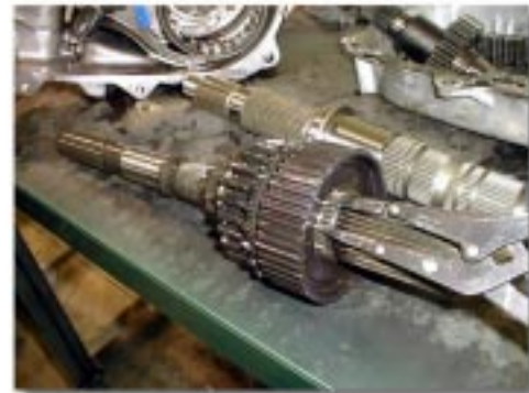
(Fig. 12) Front Drive Chain & Shaft Removal