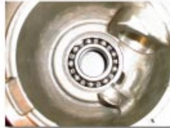
(Fig. 10A) Bearing Installed and Retained with the 716464 Snap Ring

SPECIAL NOTE: The components packaged in this kit have been assembled and machined for specific type of conversions. Modifications to any of the components will void any possible warranty or return privileges. If you do not fully understand modifications or changes that will be required to complete your conversion, we strongly recommend that you contact our sales department for more information. This instruction sheet is only to be used for the assembly of Advance Adapter components. We recommend that a service manual pertaining to your vehicle be obtained for specific torque values, wiring diagrams and other related equipment. These manuals are normally available at automotive dealerships and parts stores.