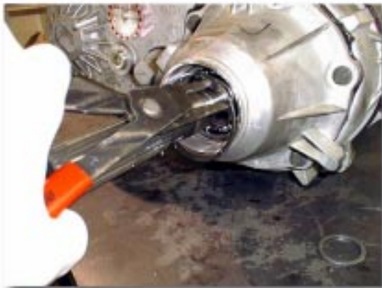
(Fig. 6) Rear O.D. Snap Ring Removal