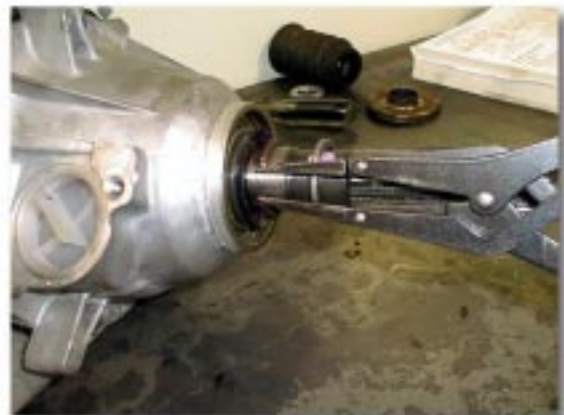
(Fig. 4) Stop Spacer & Snap Ring Removal

SPECIAL NOTE: The components packaged in this kit have been assembled and machined for specific type of conversions. Modifications to any of the components will void any possible warranty or return privileges. If you do not fully understand modifications or changes that will be required to complete your conversion, we strongly recommend that you contact our sales department for more information. This instruction sheet is only to be used for the assembly of Advance Adapter components. We recommend that a service manual pertaining to your vehicle be obtained for specific torque values, wiring diagrams and other related equipment. These manuals are normally available at automotive dealerships and parts stores.