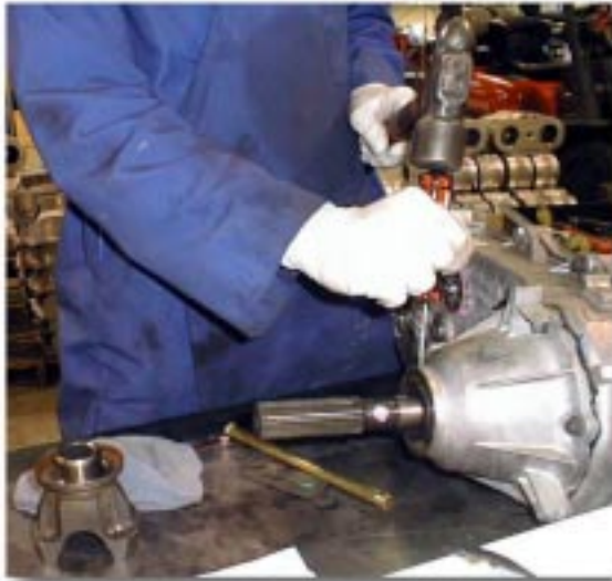
(Fig. 5) Rear Seal Removal