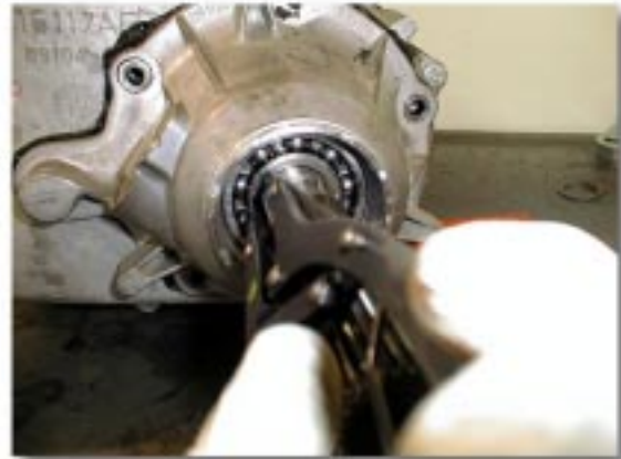
(Fig. 7) Rear I.D. Snap Ring Removal