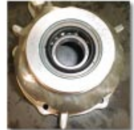
(Fig. 11A) Seal Installed