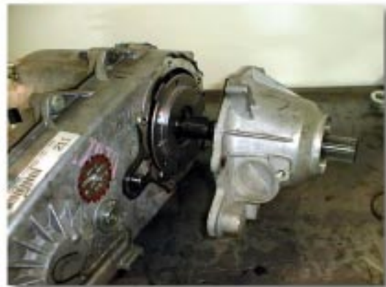
(Fig. 8) Rear Tailhousing Removal