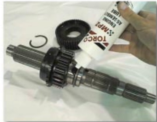
(Fig. 3A) New Main Output Shaft Assembly