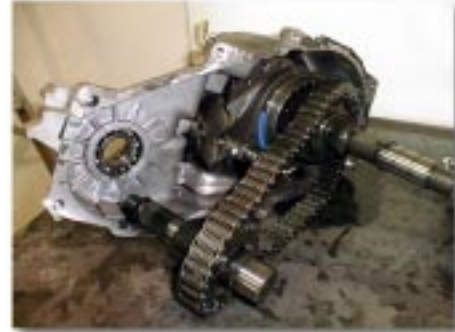
(Fig. 11) Front Drive Chain & Shaft Removal