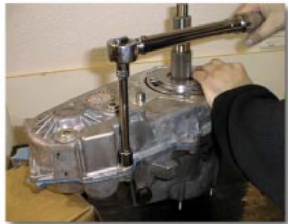
(Fig. 8A) Case Halves Assembled