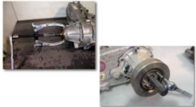
(Fig. 3) Slinger Removed / Harmonic Dampener