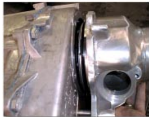
(Fig. 12A) Tailhousing Installation