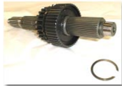
(Fig. 4A) (Large) Retaining Ring Installation