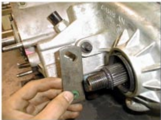
(Fig. 2) Range Selector Removal