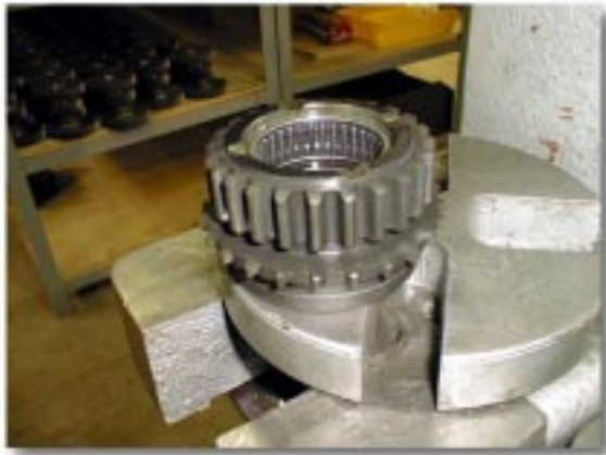
(Fig. 1A) Drive Sprocket Needle Bearings