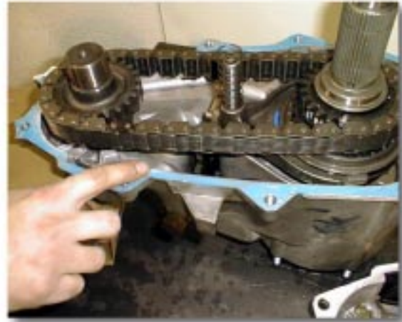
(Fig. 7A) Thin film RTV Applied Prior to Mating Case Halves.