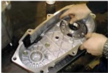
(Fig. 6A) Case Half Pre-assembly