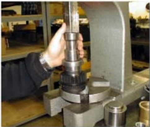
(Fig. 2A) Pull the Needle Bearings Out

On 1997 and newer transfer cases, the drive sprocket does not use caged needle bearings. If you have this newer style, then continue on to Fig. 3A (2).