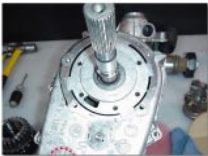
(Fig. 10) Oil Pump Removal